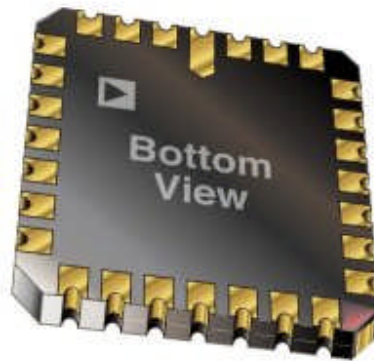
FIG. 1 - LCCC

The leadless ceramic chip carrier (LCCC), also known as a ceramic flat pack, was an early package design that allowed a direct connection to the printed circuit board, or surface mounting. This was well before plastic packaging made the scene. The LCCC interconnect was a land grid array (LGA), simply a set of solderable pads, that allowed the ceramic package to be directly connected to a PCB. The pads could be formed using ceramic-metal ink (cermet), or by direct metallization. The common cermet pads were composed of silver-palladium that was readily solderable. Although leads were added to make perimeter packages, including DIP (dual in-line package) and PGAs (Pin Grid Arrays), the leadless format remained popular. By the 1960’s, wire bonding had become the preferred chip-connection process although IBM was having good success with flip chip assembly to ceramic packages for mainframe computers.